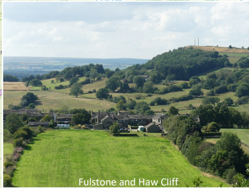
Fulstone and Haw Cliff