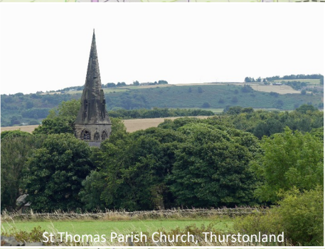
St Thomas Parish Church, Thurstonland