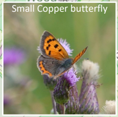
Small Copper butterfly